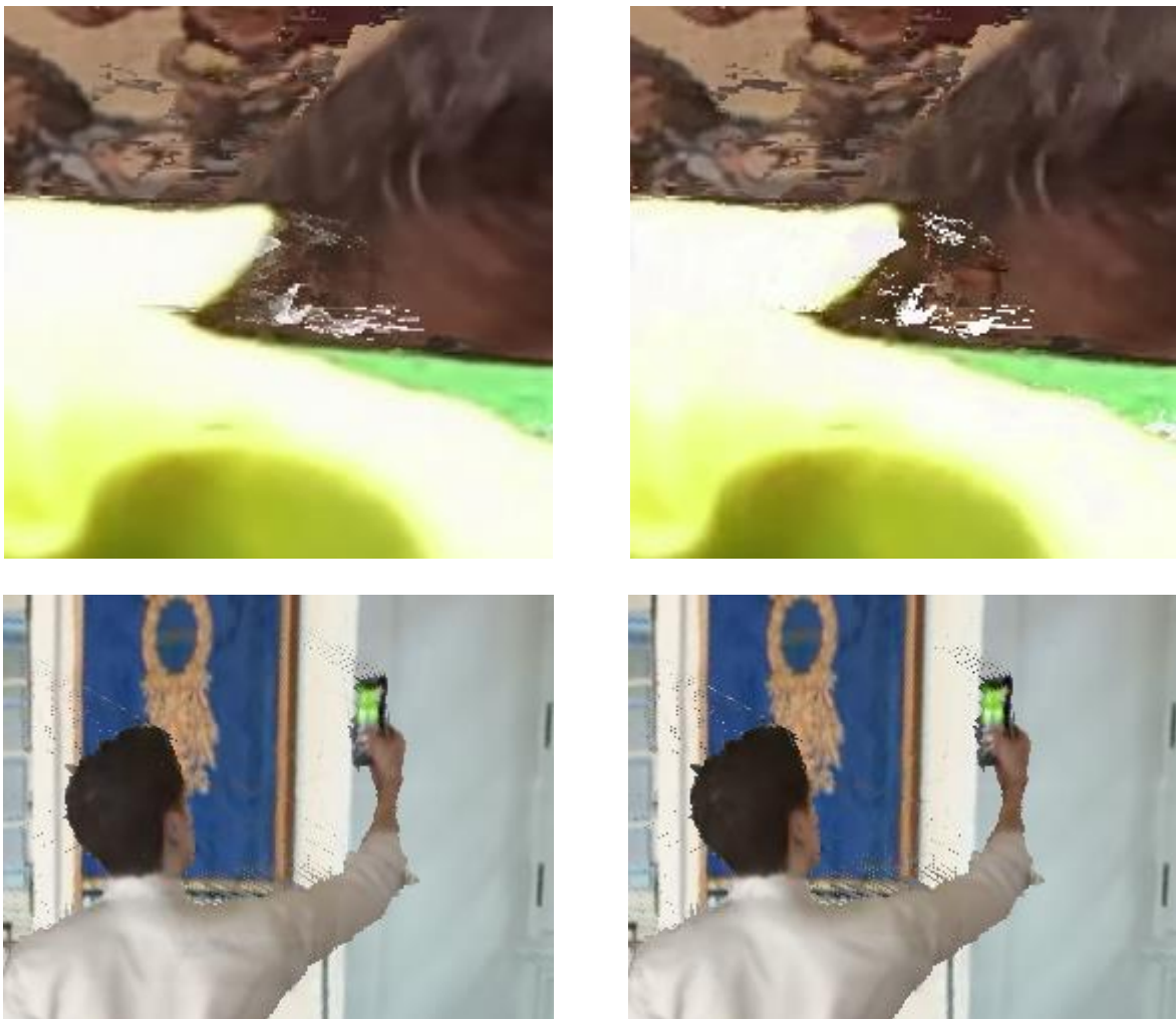
Fig. 2. TMIV 2.0 blending (left) vs. proposed blending with threshold (right).

Proposed method also exposes small artifacts (mostly caused by wrong depth values, Fig. 2), however they seem to be less irritating than large improperly-blended areas.