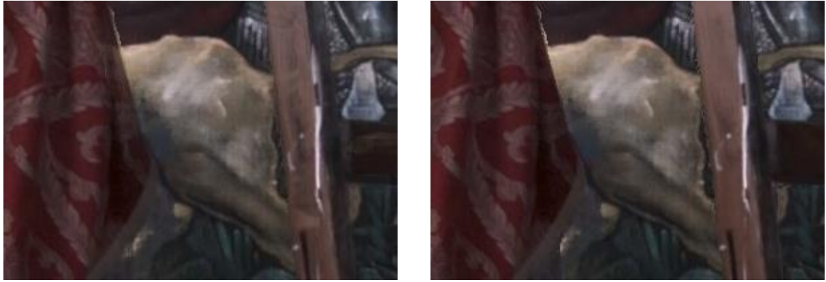
Fig. 1. TMIV 2.0 blending (left) vs. proposed blending with threshold (right).

Proposed method also exposes small artifacts (mostly caused by wrong depth values, Fig. 2), however they seem to be less irritating than large improperly-blended areas.