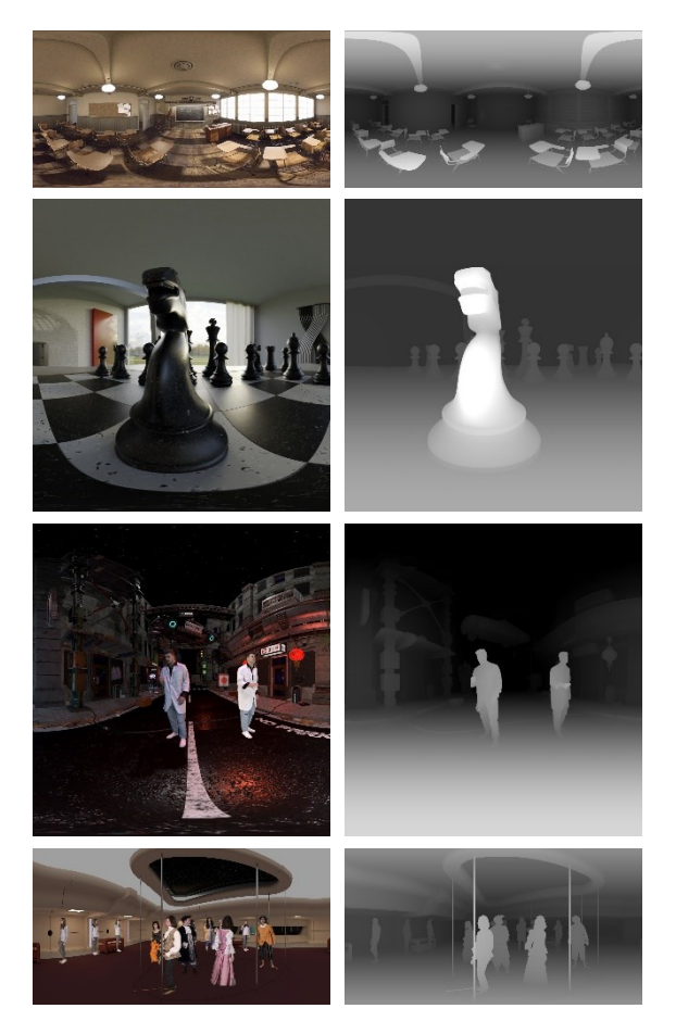
Figure 2. Input views and corresponding depth maps for (from top): ClassroomVideo, Chess, Cyberpunk, and Hijack.

The implementations differ in usage of AVX2 and AVX512 instruction sets, multi-threading (MT), and Independent Projection Targets (IPT) technique which allows to use separate buffers for each thread during depth projection.